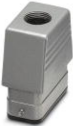
HEAVYCON sleeve housing D15 for single locking latch, height 66 mm, without support 1x M20, straight conductor exit

Please be informed that the data shown in this PDF Document is generated from our Online Catalog. Please find the complete data in the user's documentation. Our General Terms of Use for Downloads are valid ( http://download.phoenixcontact.com )