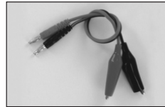
Crocodile clip charging cable 5201-0031-01