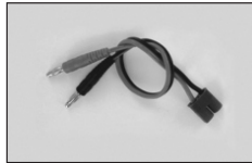
EC3 charging cable 5201-0034-01