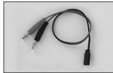
Futaba RX charging cable 5201-0044-01