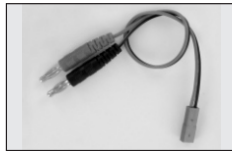
JST/BEC charging cable 5201-0043-01