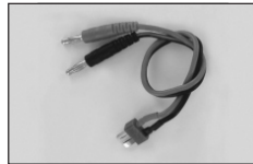
Dean charging cable 5201-0012-01