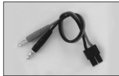
TRAXXAS charging cable 5201-0033-01