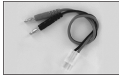
Tamiya charging cable 5201-0030-01