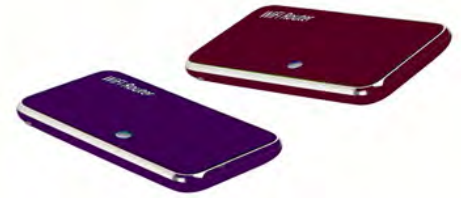
Mobile Wi-Fi* devices